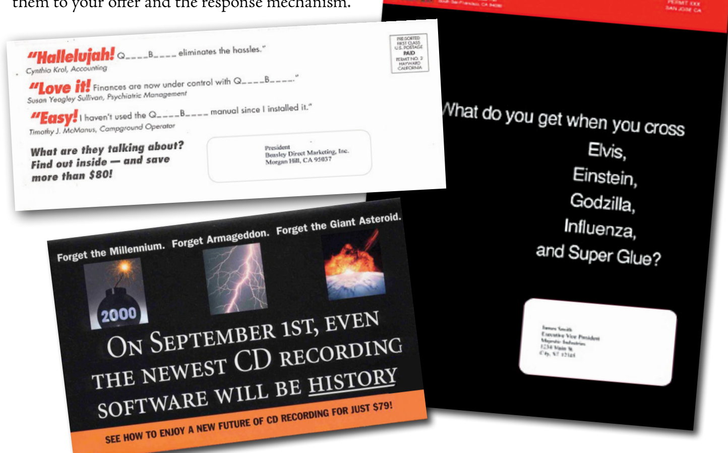
These direct mail campaigns had intriguing headlines that drew the reader in to read the letter and brochure.

Action item: If the circulation quantity for your mailing permits, test outer envelope "teasers" every time you mail. Time and time again, a minor variation in the teaser has produced a dramatic difference in response. An outer envelope test is also one of the simplest and cheapest tests you can do. And don't forget to test "blind" outers that look like business mail and give the recipient no reason not to open the envelope; blind outers quite often outperform even the hardest-hitting teaser message.